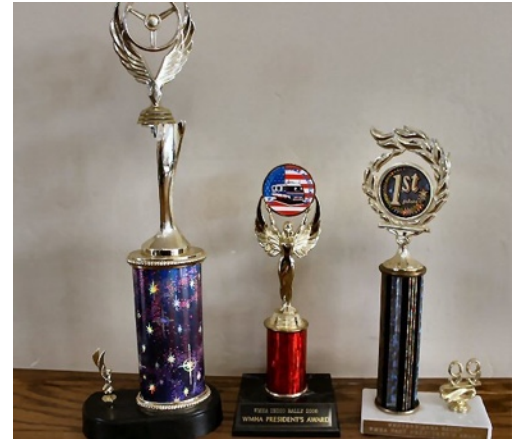
Early Heartland Awards