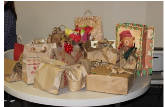
Brown bag exchange game