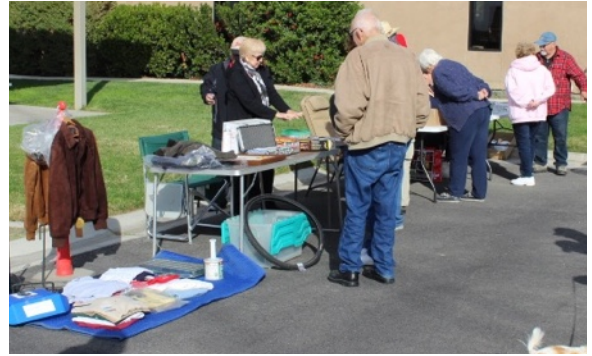
Out door craft and items for sale