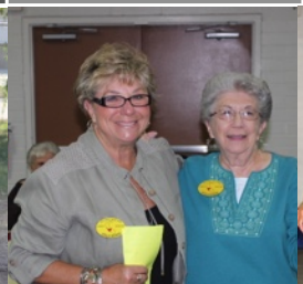
DANCING LINE DANCERS