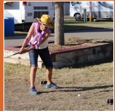
2nd place winners