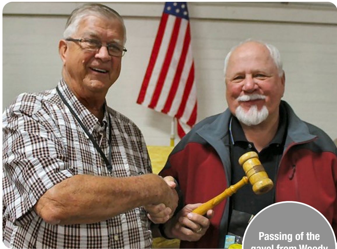
Passing of the gavel from Woody to Fred

New officers line up for the 2016-2017 year