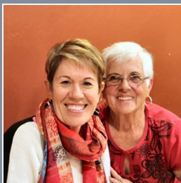
Fire Place Lady