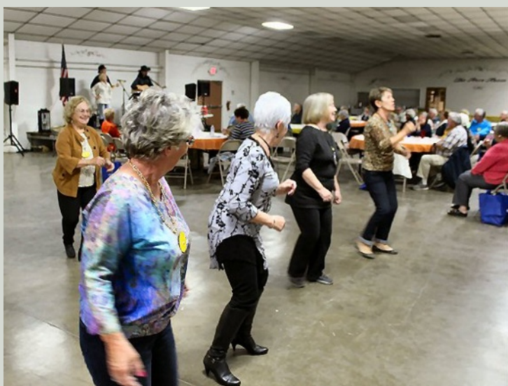
Our ladies line dancing to the music by the band