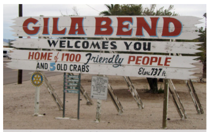
Most of the residents of Gila Bend, Arizona are nice. But there are some crabby people, too!

heat. You may still submit your letter for future issues of the newsletter.