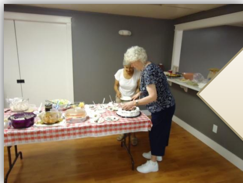
Desserts & Bar-B-Ques

If you are interested in receiving a quote, please do not hesitate to contact me at 877-589-3599 EXT 207.