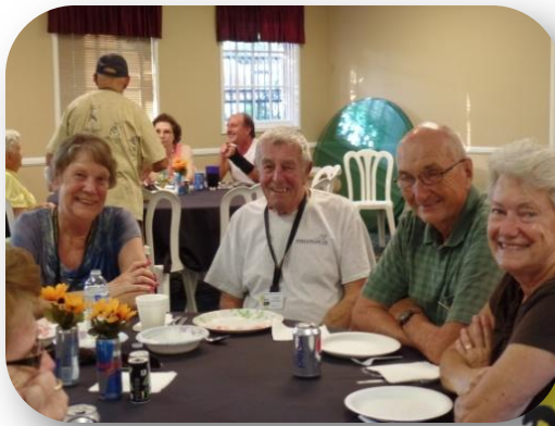
Good food, good friends