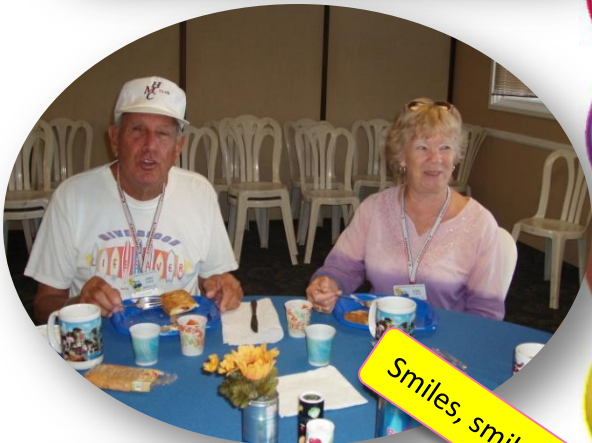
Smiles, smiles and more smiles