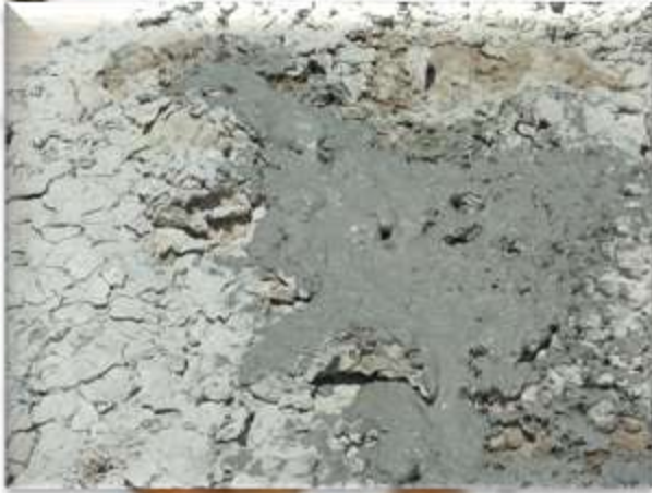
Bubbling Goo from Deep Underground