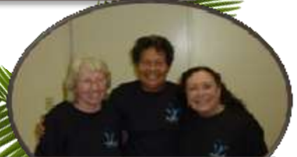
The Cheerful Fountain Staff