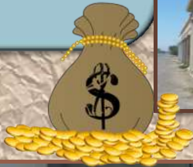
The Group Visit to the Historical Bank