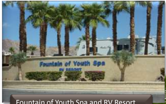
Fountain of Youth Spa and RV Resort