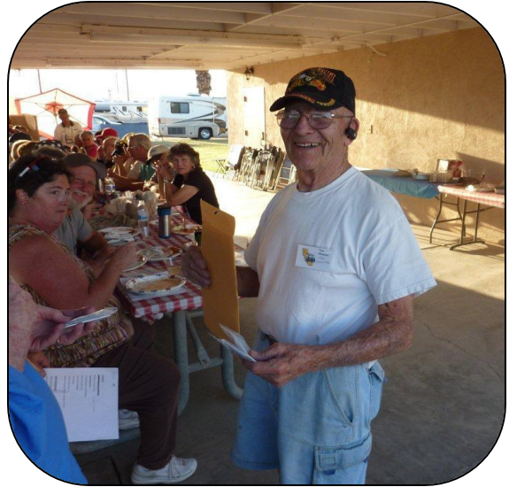
No spaghetti left on those plates!!