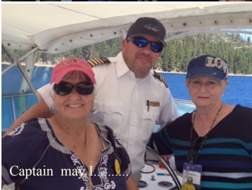
Captain may I.....