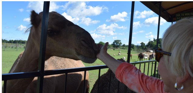
Visit an Amish animal farm