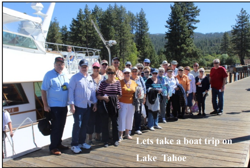
Lets take a boat trip on Lake Tahoe

When ever there is food to be prepared, this team knows how to put everything together.