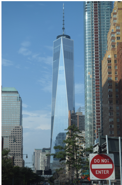
New York One World trade center and Times Square