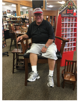
Amish fine furniture