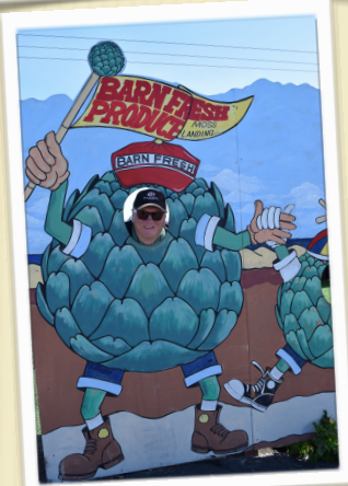
Motorcycle clothing shop and artichoke fruit stand