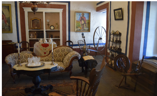
One of the preserved rooms in the mission.