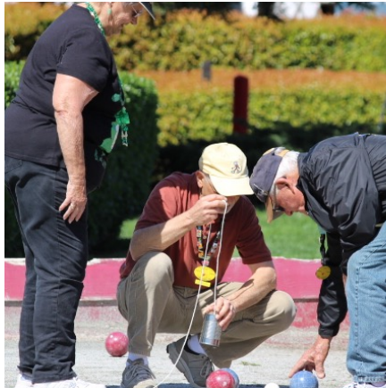
We had a bocce ball tournament

There is a long history that goes back to 1797 when this old mission was founded. We watched a movie on the history of the California missions and it was very interesting. As we walked around the grounds you could just imagine what would have taken place back then.