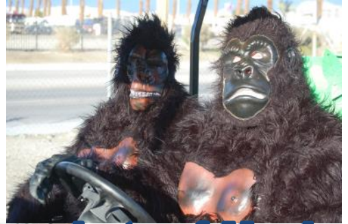
Lots of Monkey Business