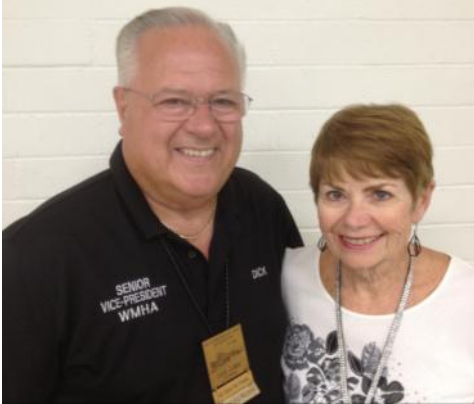
On Sept. 25th we had our Annual Western Motor Home Association Meeting in Hanford, CA and it was well attended. I thank all the National Directors, Chap-

ter Presidents or VP's, and Indio Captains who attended. Those of you that did not attend I hope you will make this meeting a priority to attend next year. The 2012 – 2013 budget was passed as presented after a line by line discussion. We then had time for Regional Workshops. After lunch the afternoon was spent planning our Indio Western Area Rally. Changes for 2013 are that we are moving Will Call & on Site Registration to the Holding Area. Electric will now be included on the Rally Registration. Chapter Party Areas will be charged for by the number of electric plugs they use, the charge is $60 each. Each Captain presented his needs for supplies, golf carts, & misc. All volunteers will have electric when they come