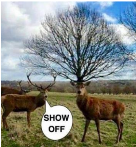
I know what I'm doing the next time it snows